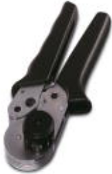
Crimping pliers. with positioner, for turned plug-in connector contacts 0.14 mm 2 to 2.5 mm 2

Please be informed that the data shown in this PDF Document is generated from our Online Catalog. Please find the complete data in the user's documentation. Our General Terms of Use for Downloads are valid ( http://download.phoenixcontact.com )